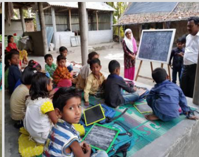
Academic Interactions (Jangol Mahol units in Medinipur-W and Bankura)