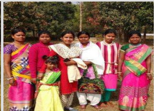
Academic Interactions (Jalpaiguri)